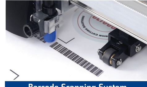
Barcode Scanning System