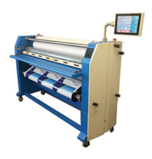
663-TH 63" TOP HEAT LAMINATOR