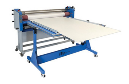
FT48 FEEDING TABLE & CUTTING MAT