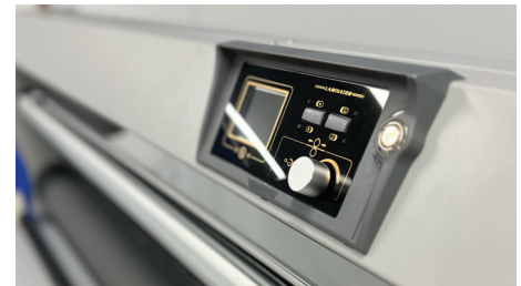
Close-up of Front Panel