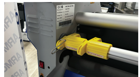
Adjustable Vertical Cutting System